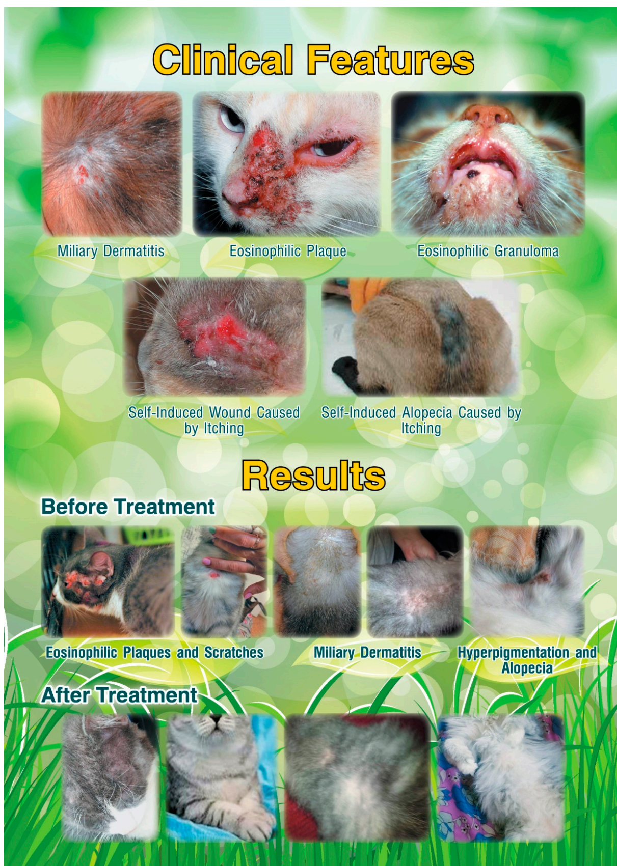
Fig. 2. Clinical features and results

The data obtained make it possible to state that the influence and nature of the therapeutic action of complex LLLT in cats with hypersensitivity to flea bites are reflected in the positive dynamics of the clinical picture of the disease, morphological composition of blood, regenerative function of the skin, serum IgE concentration decrease.